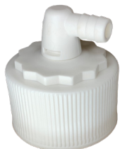
90° Swivel Barb For tight fitting environments with additional flexibility