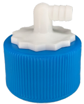
90° Fixed Barb For tight fitting environments