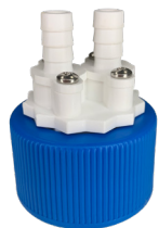
Dual Port For dual dilution and dispensing