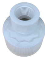
National Pipe Thread (NPT) Adapter To allow for connection directly from the main water source.