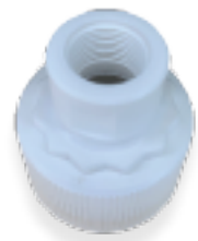
National Pipe Thread Adapter to allow for connection directly from the main water source