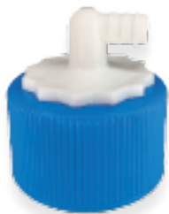
90° Fixed Barb for tight fitting environments