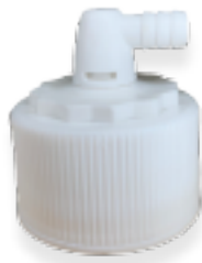
90° Swivel Barb for tight fitting environments with added flexibility