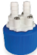
Dual Port for dual dilution and dispensing